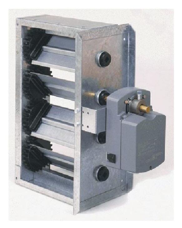
Figure 1: ZD-1800 with Electric Actuator

ZD-1800 Zone dampers are designed and built for light commercial and residential variable volume zone control only and must not be used for tight shutoff. These dampers are intended for motorized operation but can be used with a manual-locking quadrant when required. No seals are provided.